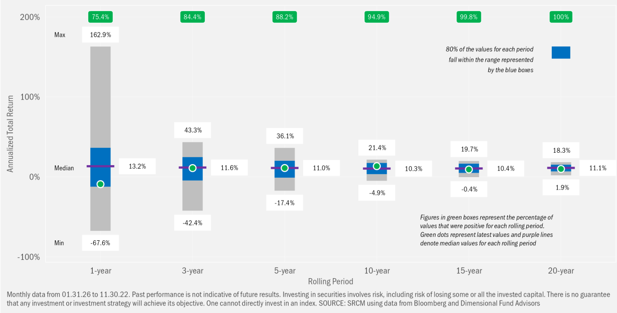
Figure 2: S&P 500 Historical Range of Returns by Time Horizon

Looking at market returns only through the January-to-December lens masks the fact that stocks are pretty volatile over any 12-month period, including those that don’t begin in January. Starting from the beginning of 1926, there have been 1,152 12-month periods through the end of November 2022. The median return of the S&P 500 Index across those “rolling” periods was 13.2%. Well distant from the far more extreme drops seen in history, the S&P’s decline of 9.2% (including dividends) over the past 12 months (November 2021 through November 2022) sits well within the range of values that most results fall.